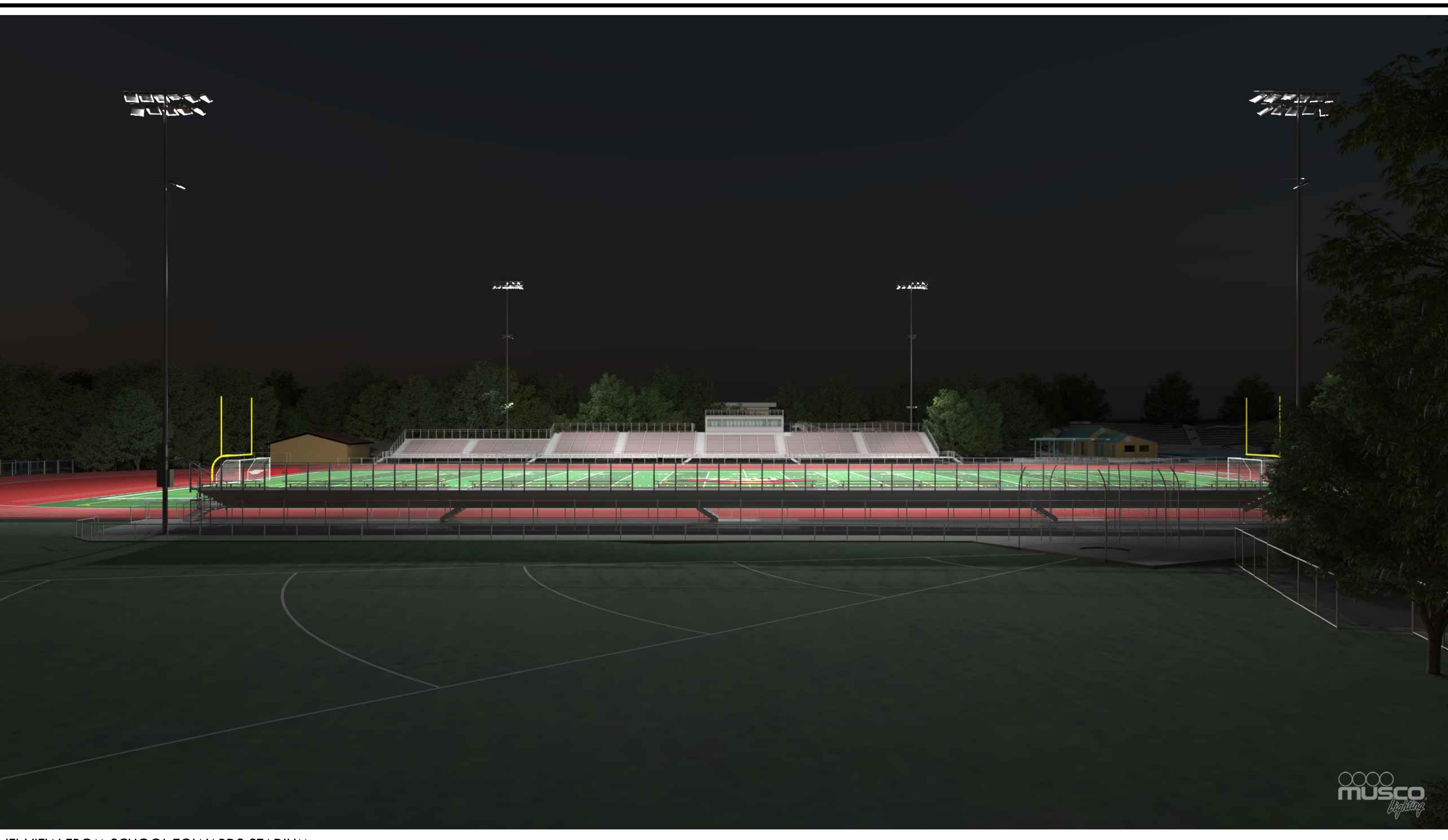
(E) VIEW FROM SCHOOL TOWARDS STADIUM