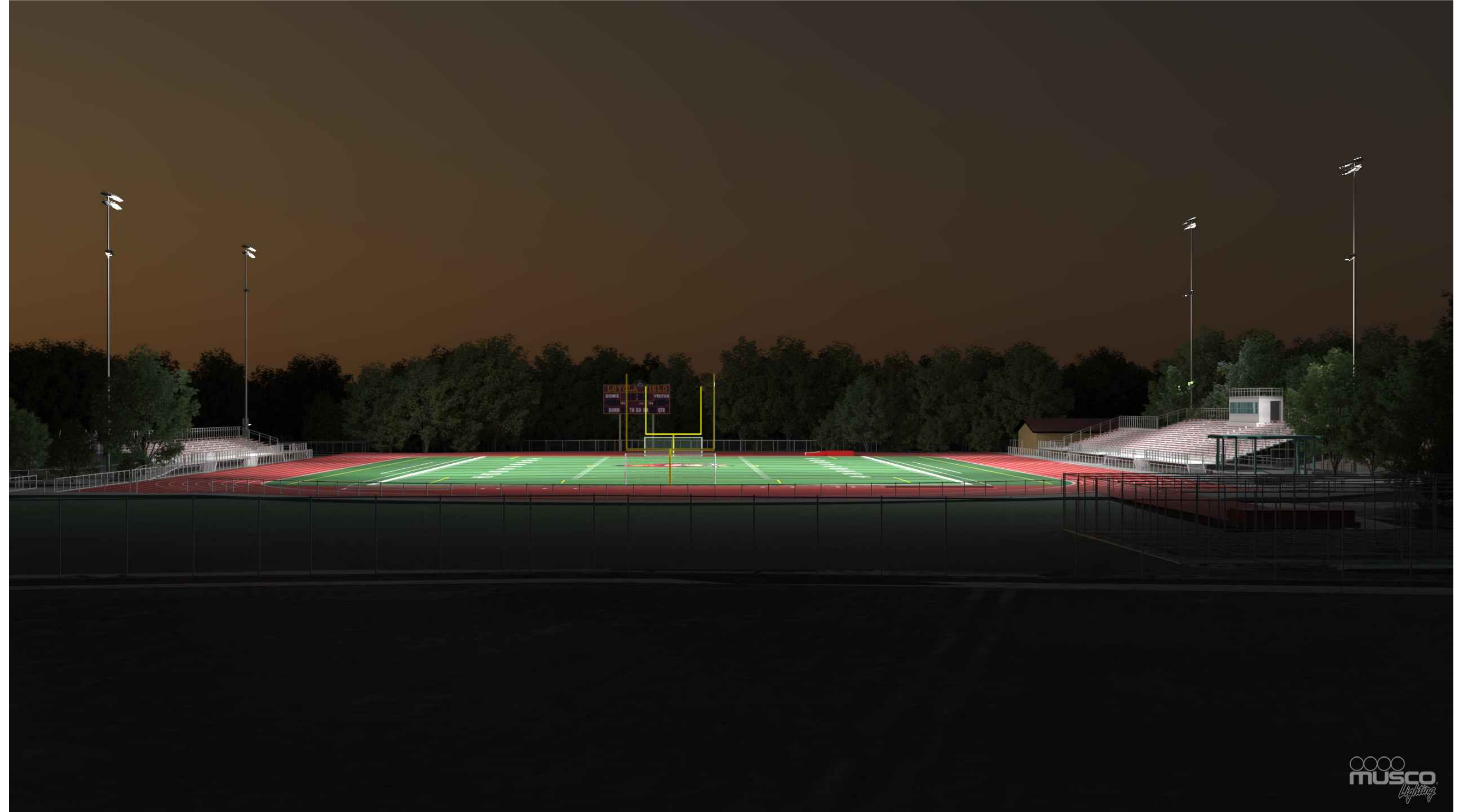
(D) VIEW FROM SCHOOL TOWARDS STADIUM (FROM BASEBALL FIELD)

DRAWING NAME: C:\Users\station27\AppData\Local\Temp\AcPublish_13804\_MUSCO.dwg PLOT DATE: 03-03-22 PLOTTED BY: station27